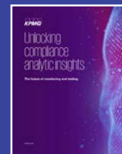
Unlocking compliance analytic insights