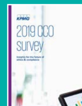
2019 Chief Compliance Officer Survey