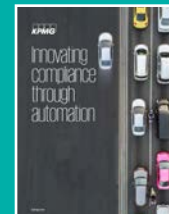
Innovating compliance through automation