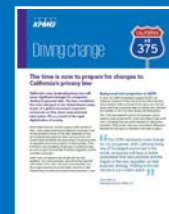
Driving Change | The California Consumer Privacy Act