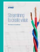
Streamlining to create value