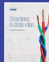
Streamlining to create value