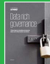
Data rich governance