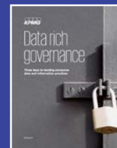
Data rich governance