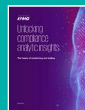
Unlocking compliance analytic insights