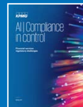
AI | Compliance in Control