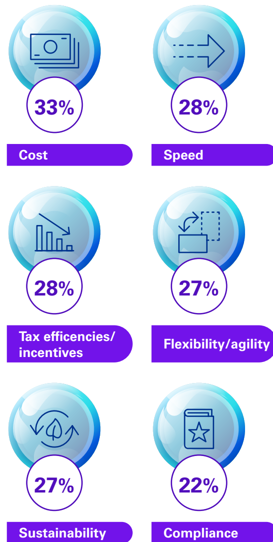
Figure 2: Cost stands as the most important outcome in supply chain strategies, with agility in fourth place

But when cost is pitched against resilience and agility, the data shows that price is still the primary driver of supply chain strategies.