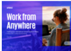
Work from Anywhere: Enabling your international remote workforce today