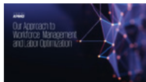
Our Approach to Workforce Management and Labor Optimization