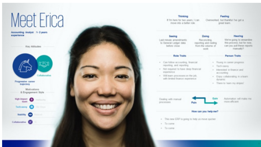
Detailed personas help customize the learning experience for employees.

Empathy maps collect what each persona thinks, feels, says, and does when faced with a challenge. Empathy makes learning relevant by merging training for business processes with systems training for a more impactful learning experience.