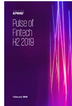
Pulse of Fintech H2 2019

The following are several recent examples.