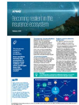
Becoming resilient in the insurance ecosystem