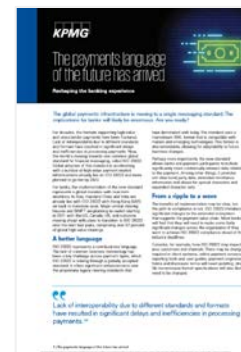
A new standard for payments