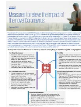
Measures to relieve the impact of the novel Coronavirus