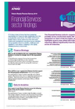
Future Ready Finance Survey 2019: Financial Services sector findings