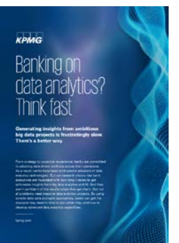
Banking on data analytics? Think fast

The following are several recent examples.