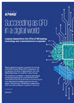
Succeeding as CFO in a digital world