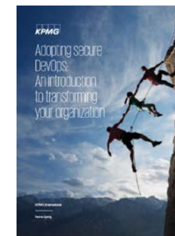
Adopting secure DevOps: An introduction to transforming your organization.