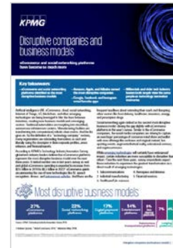
Disruptive companies and business models

The following are several recent examples.