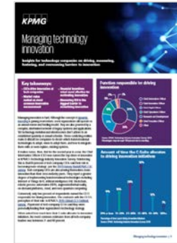
Managing Technology innovation