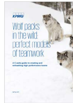
Wolf packs in the wild: perfect models of teamwork