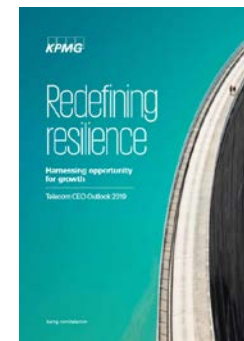
Redefining resilience: Telecom CEO Outlook 2019