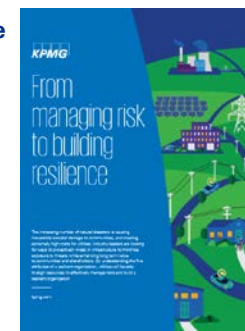
Managing risk and building resilience