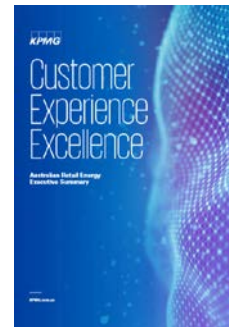
Customer Experience Excellence in the Australian Retail Energy Sector 2019