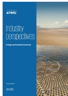
Industry perspectives – Energy and natural resources

The following are several recent examples.