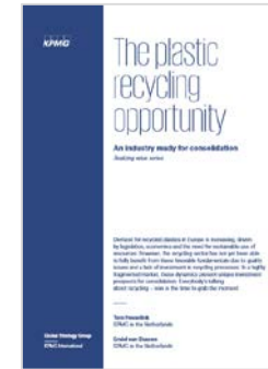
The plastic recycling opportunity