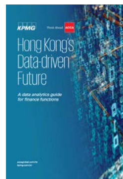
Hong Kong's Data-driven Future