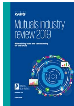
Mutuals industry review 2019