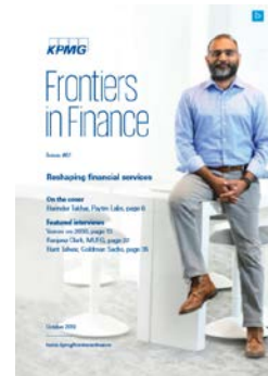
Frontiers in Finance – October 2019