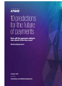
10 predictions for the future of payments