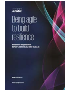
Global Insurance CEO outlook 2019