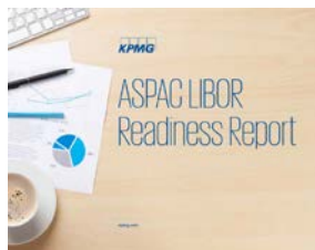
ASPAC LIBOR Readiness Report