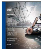
Global Automotive Executive Survey 2017.1