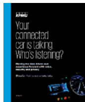
Your connected car is talking. Who's listening? 2016.12