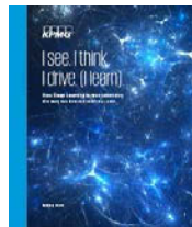
I see, I think, I drive (I learn) 2016.12