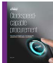
Clockspeed-capable procurement 2016.12