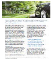
Smart car , smart business model 2016.11