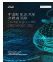
Consumer insights on New Energy Vehicles in China 2017.4